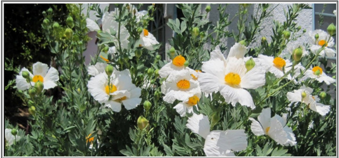
Romneya White "Fried Egg" Poppies