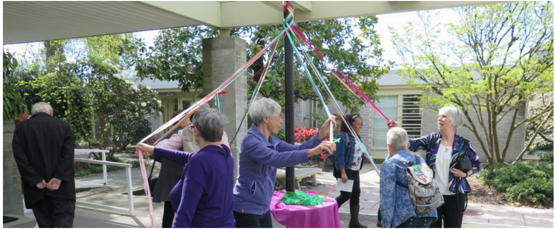
Come dance the Maypole April 29th